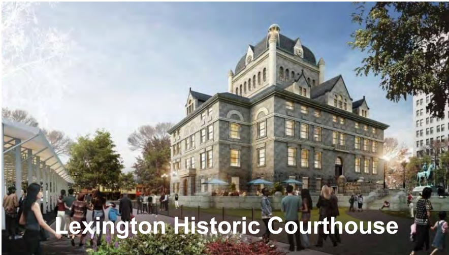
Lexington Historic Courthouse